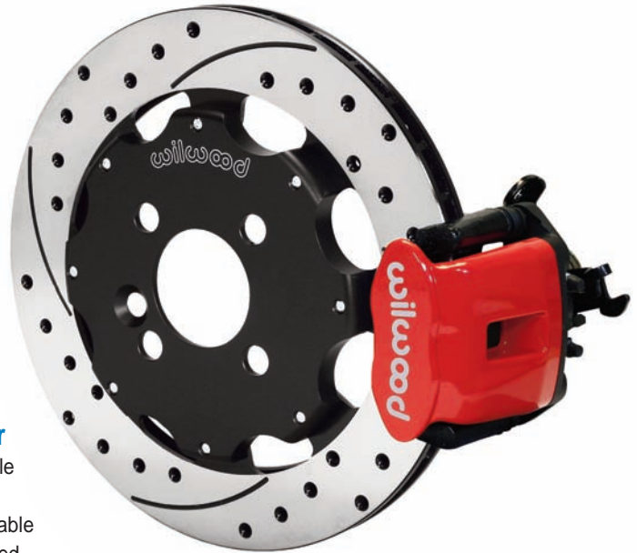
Combination Caliper Rear Parking Brake Kit with SRP Rotor Down Load High Resolution Photo, click here