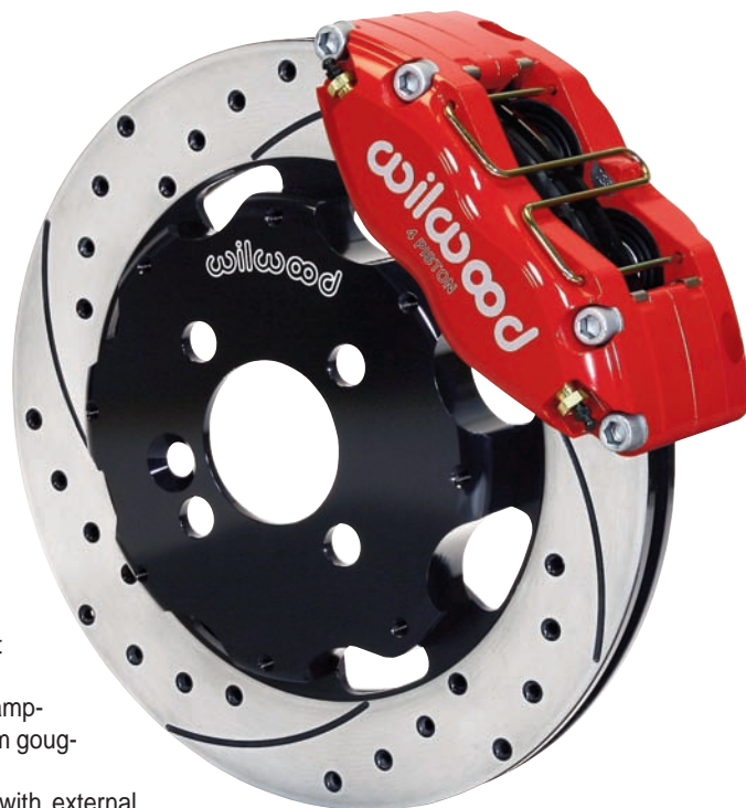
BMW Mini Cooper Big Brake Front Kit Down Load High Resolution Photo, click here

Please check the diagram on the back of this page for minimum inside wheel clearance requirements